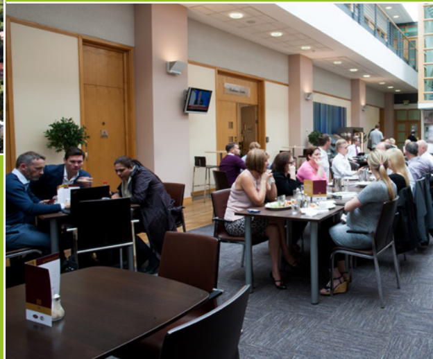
Wynyard Park House, Wynyard Business Park