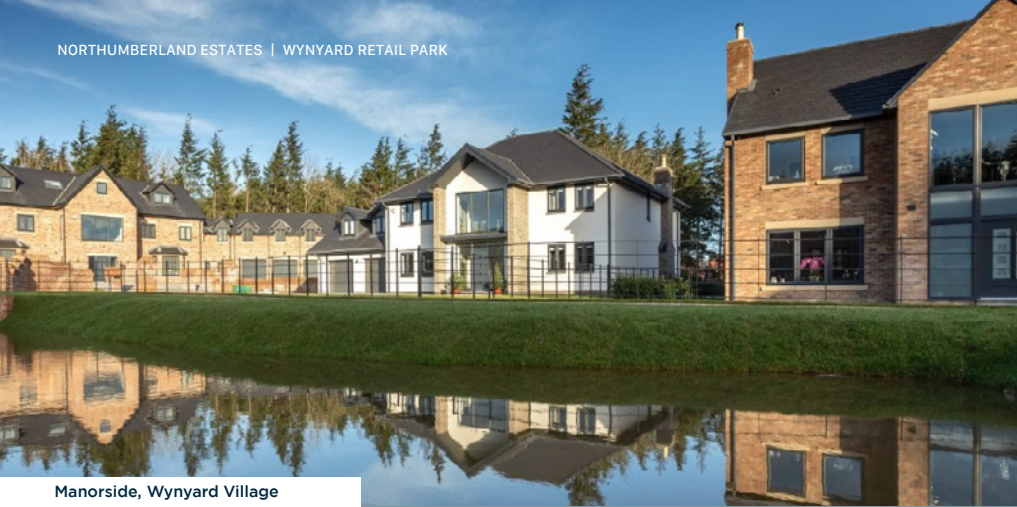
Manorside, Wynyard Village