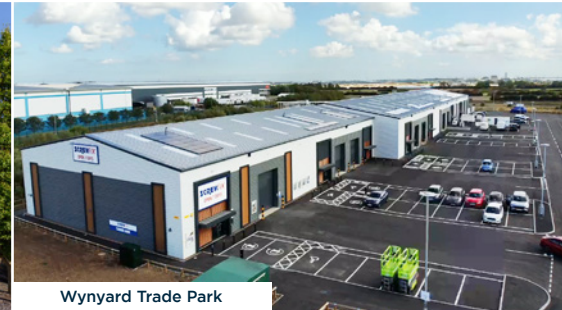
Wynyard Trade Park