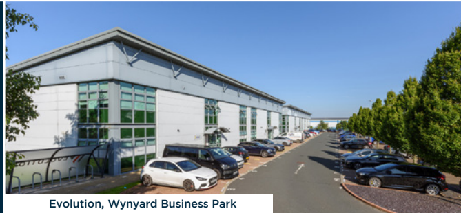
Evolution, Wynyard Business Park