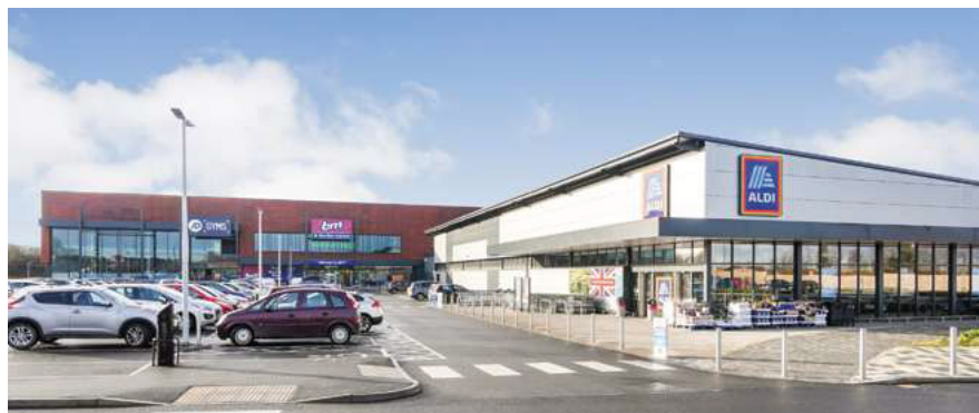
Northumberland Retail Park - 6,550 sq.m (70,500 sq.ft.) developed for Aldi, B&M, JD Gyms, Costa and Sainsbury's which anchors a 1,985 sq.m (21,368 sq.ft) retail parade