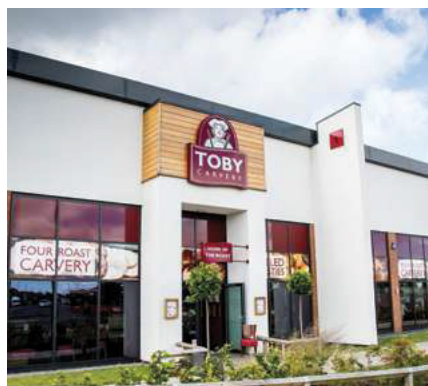
Toby Carvery - Well-established leisure development within Northumberland Retail Park scheme