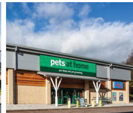
Pets at Home - 836 sq.m. (9,000 sq.ft.) out of town retail unit in Alnwick