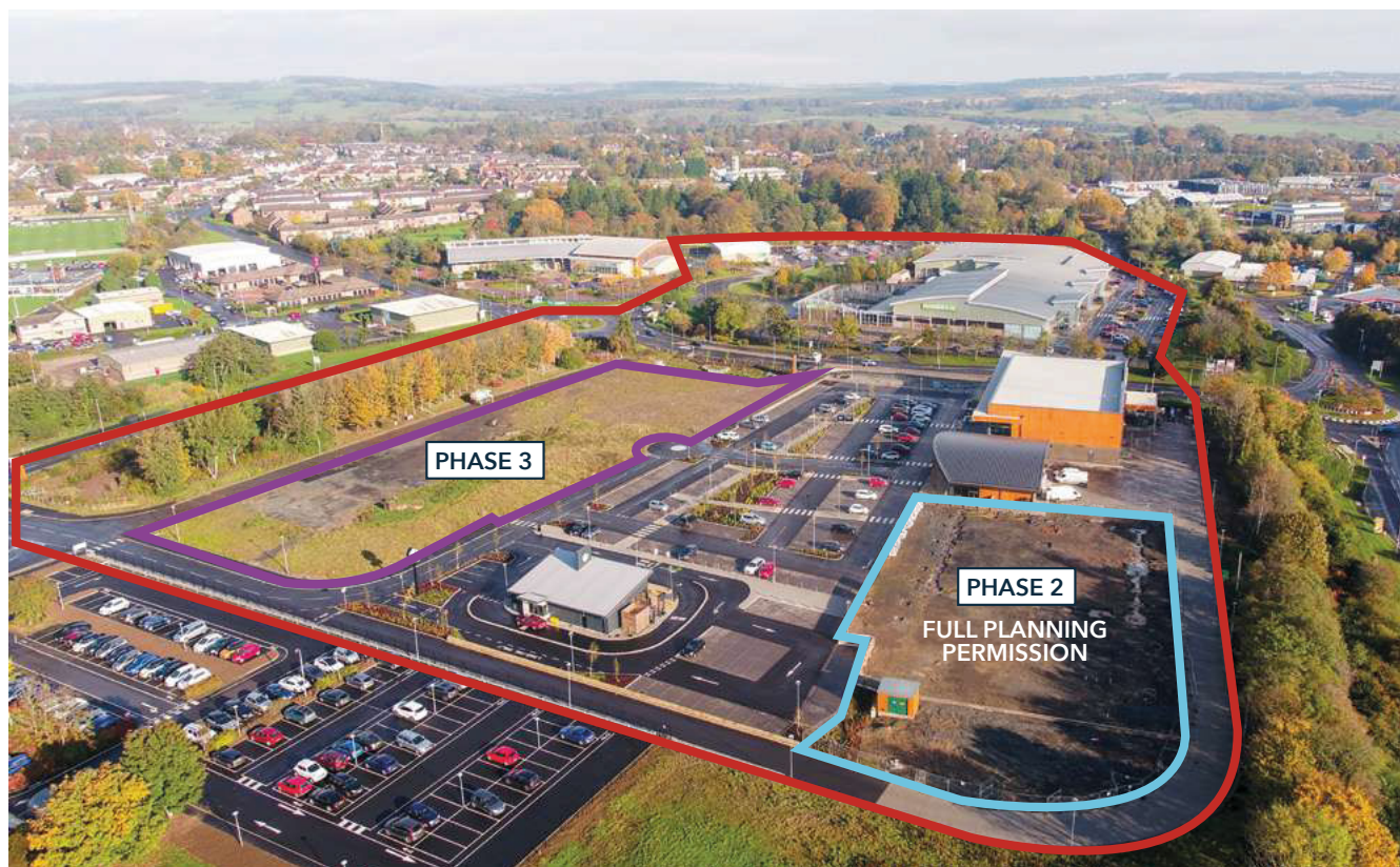
WILLOWBURN RETAIL PARK