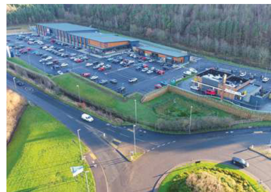
Tyneview Retail Park - 4,645 sq.m (50,000 sq.ft) under construction to be let to Aldi and B&M, alongside a Drive-thru and three smaller units