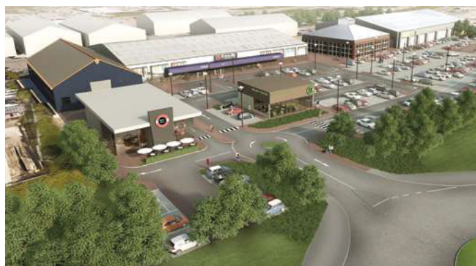
Whitley Road - Planning to be submitted for drive-thru and restaurant unit to complement existing 6,515 sq.m. (70,125 sq.ft.) retail and leisure scheme