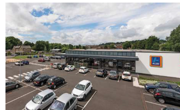
Alnwick South Road - 1,394 sq.m. (15,000 sq.ft.) retail developed for Aldi stores