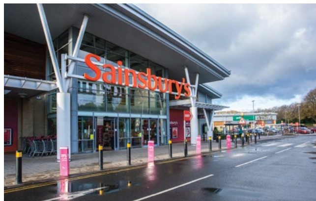
WILLOWBURN CENTRE - SAINSBURY'S

Willowburn Retail Park is immediately accessible from the A1 north and south bound slip roads into Alnwick Town and lies adjacent the A1, providing fantastic visibility.