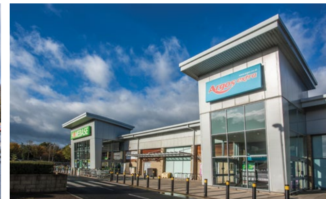
WILLOWBURN CENTRE - HOMEBASE AND ARGOS