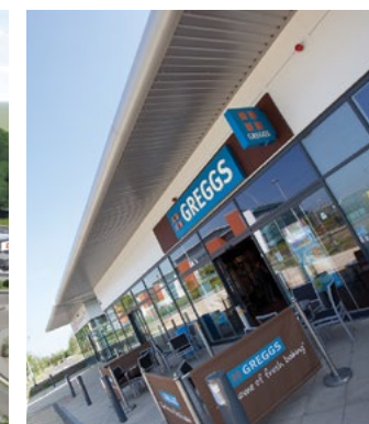
Quorum Business Park - Retail parade on major North Tyneside Business Park