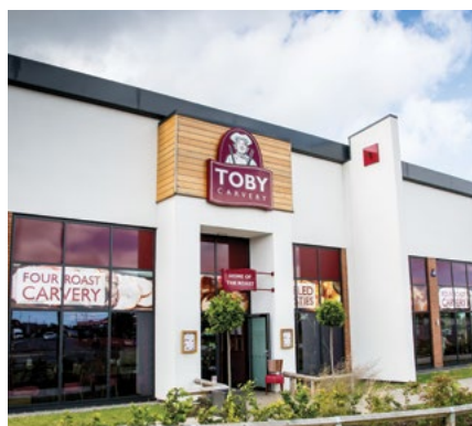
Toby Carvery - Well-established leisure development within Northumberland Retail Park scheme