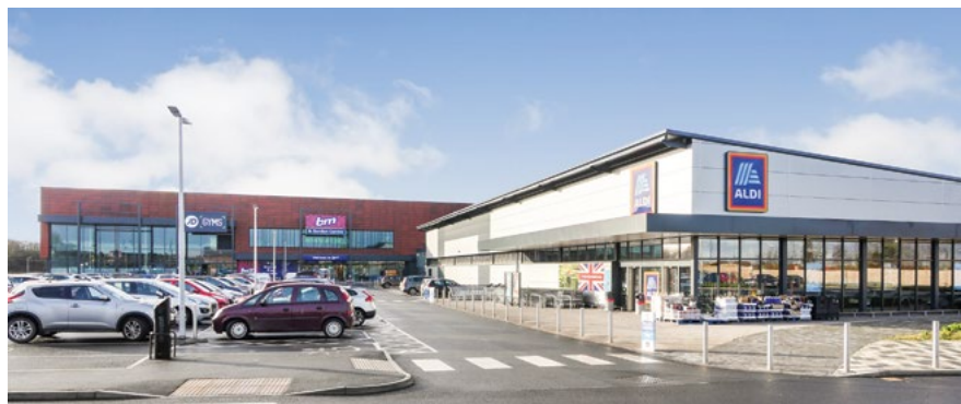
Northumberland Retail Park - 6,550 sq.m (70,500 sq.ft.) developed for Aldi, B&M, JD Gyms, Costa and Sainsbury's which anchors a 1,985 sq.m (21,368 sq.ft) retail parade