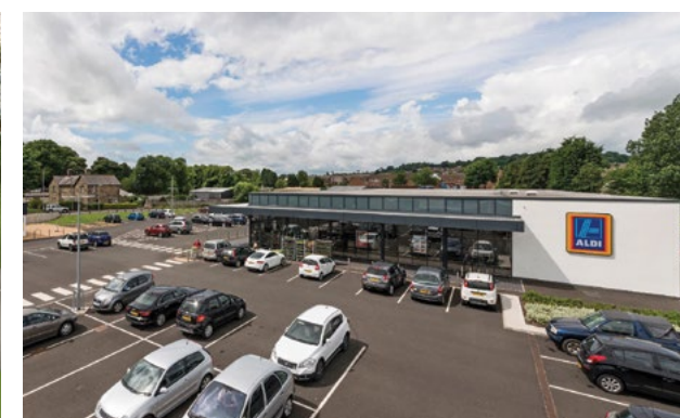
Alnwick South Road - 1,394 sq.m. (15,000 sq.ft.) retail developed for Aldi stores