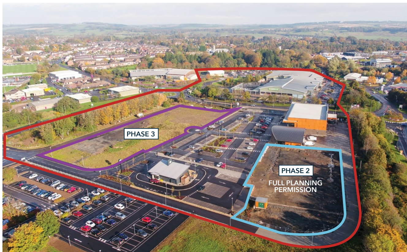
WILLOWBURN RETAIL PARK