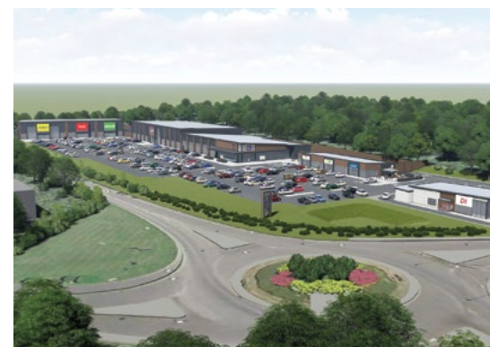
Tyneview Retail Park - 4,645 sq.m (50,000 sq.ft) under construction to be let to Aldi and B&M, alongside a Drive-thru and three smaller units