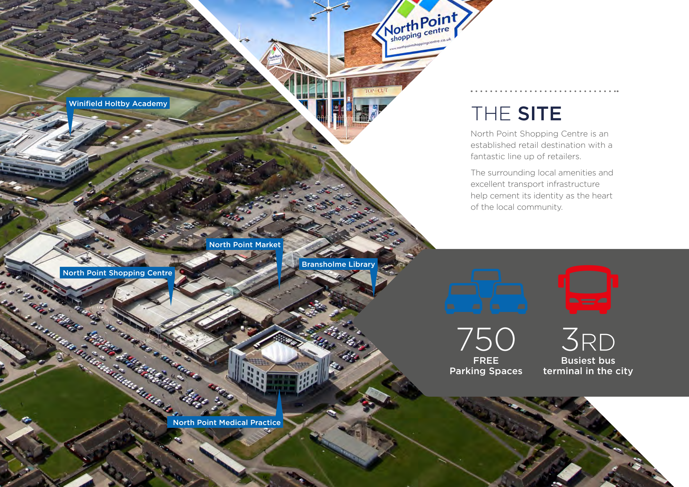
Winifield Holtby Academy