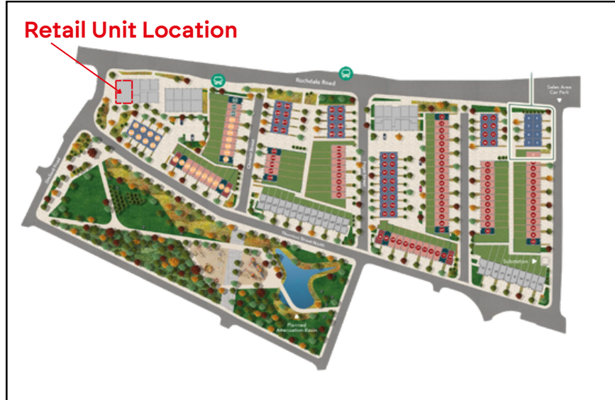
Collyhurst Location Plan