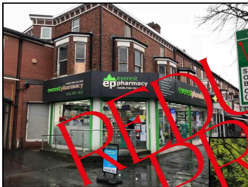
496 Wilbraham Road