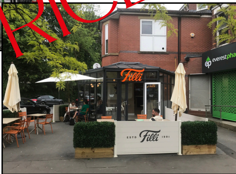
496b Wilbraham Road