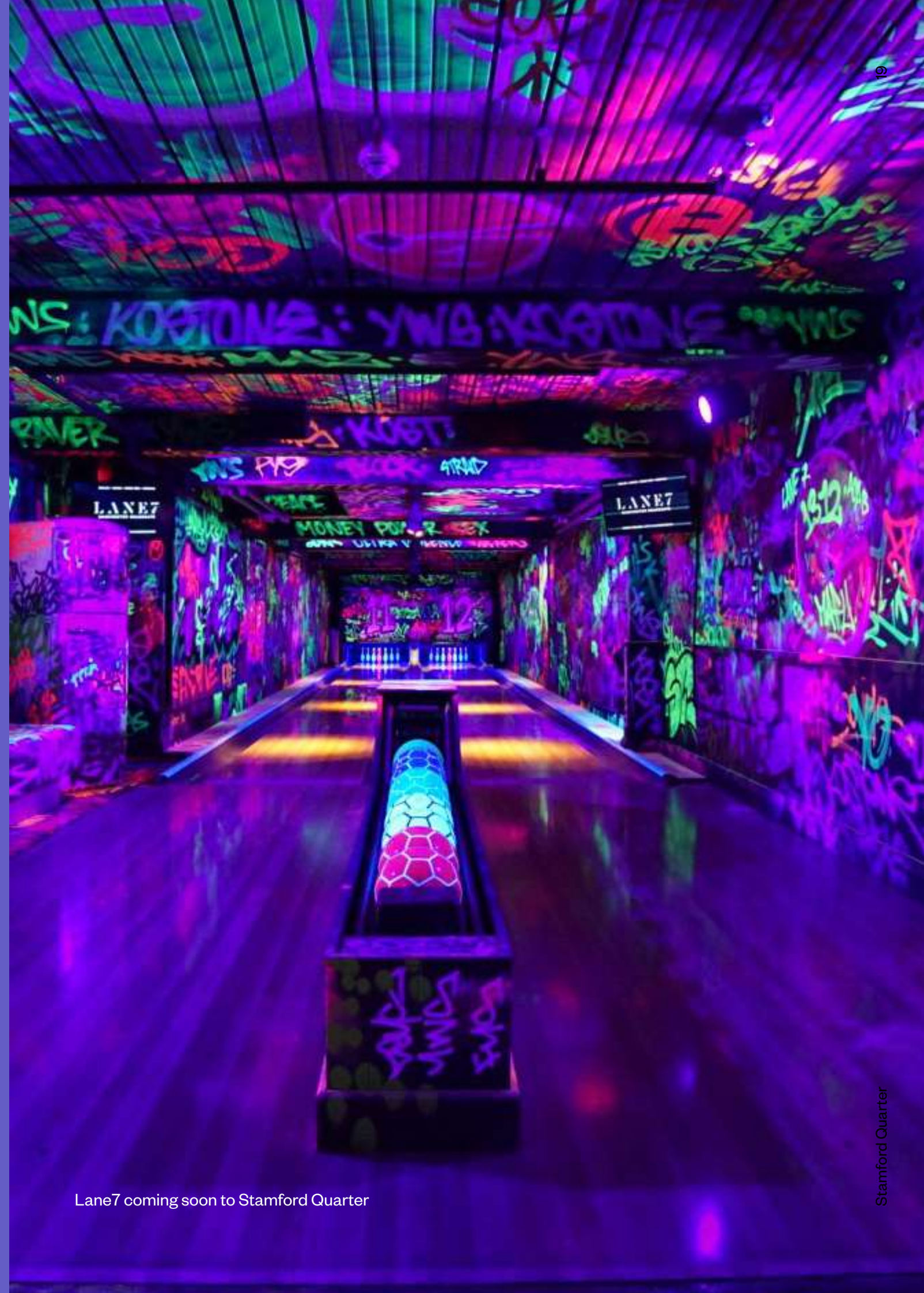
Lane7 coming soon to Stamford Quarter