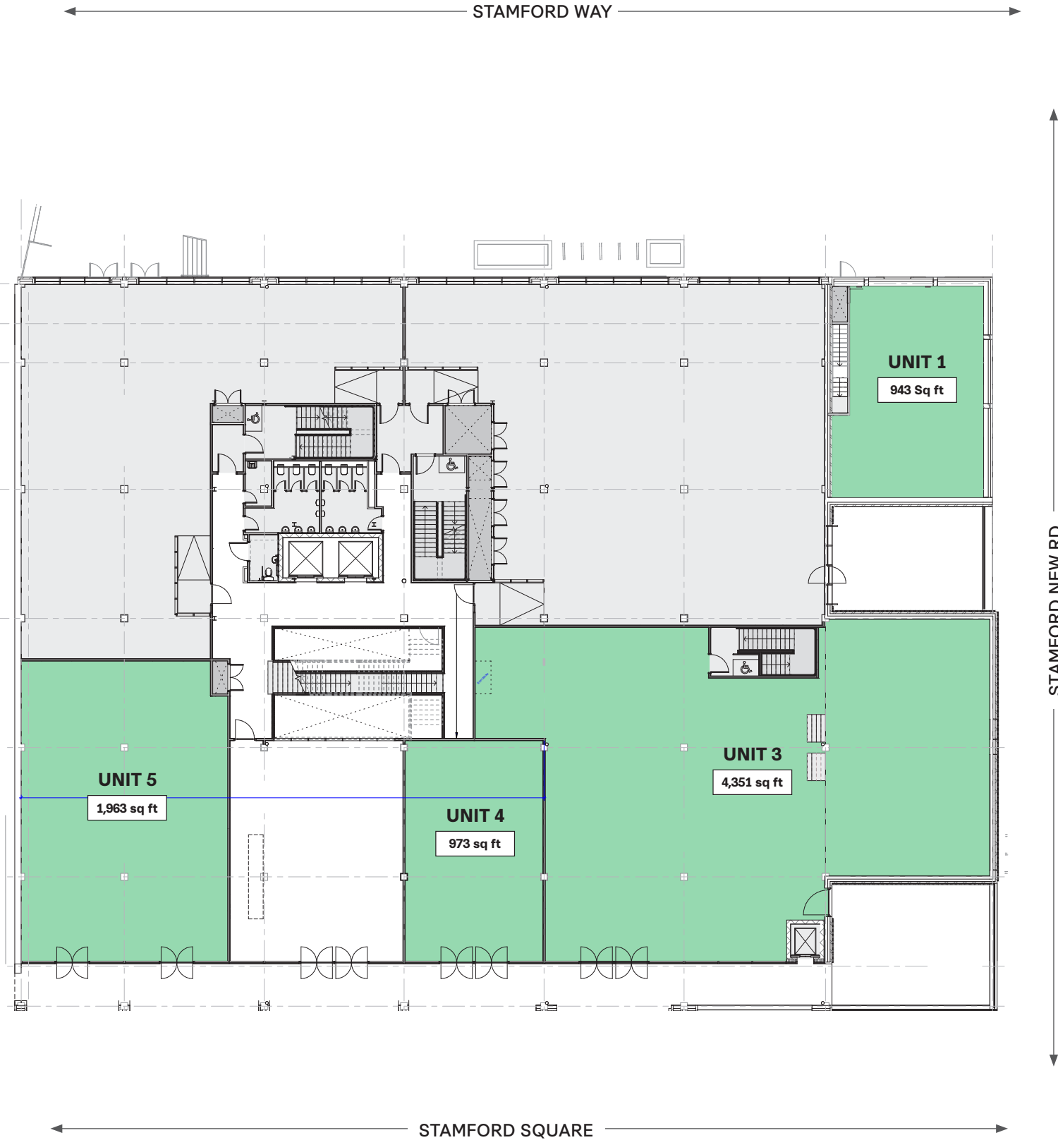
GROUND FLOOR RETAIL PLAN