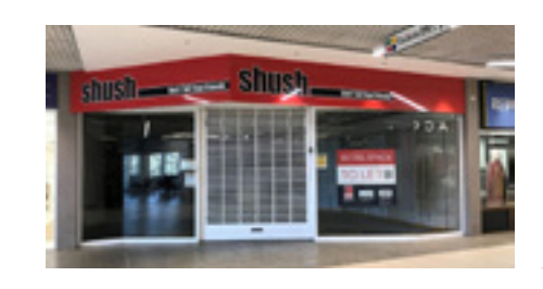
Unit 143 2,018 sq ft (187 sq.m)