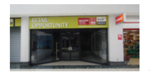
Unit 1a & 3 4,055 sq ft (377 sq.m)