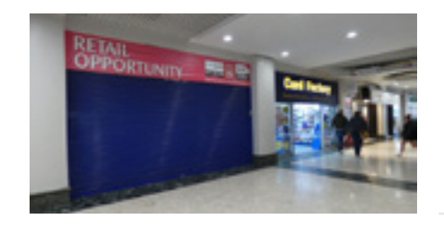
Unit 28 2,436 sq ft (226 sq.m)