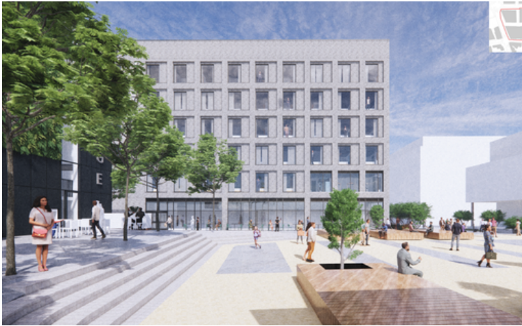
Illustrative view of Woodcock Square