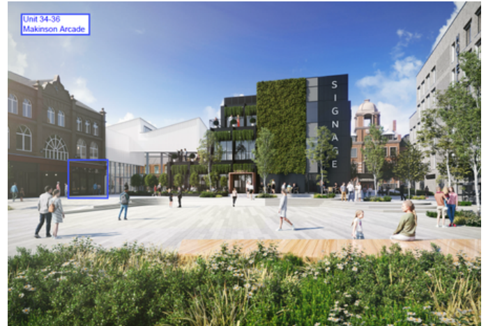
Illustrative view of Makinson Arcade